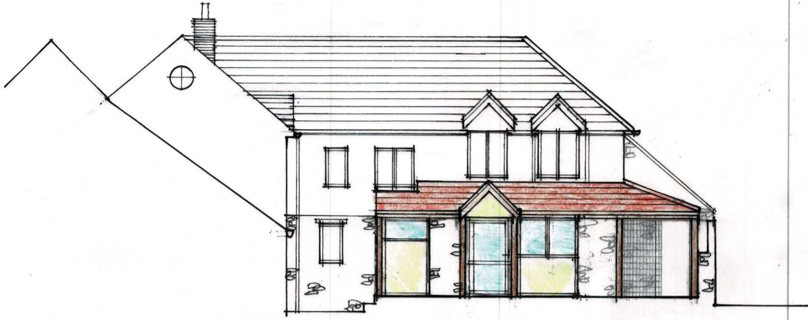
PROPOSED NORTH WEST ELEVATION